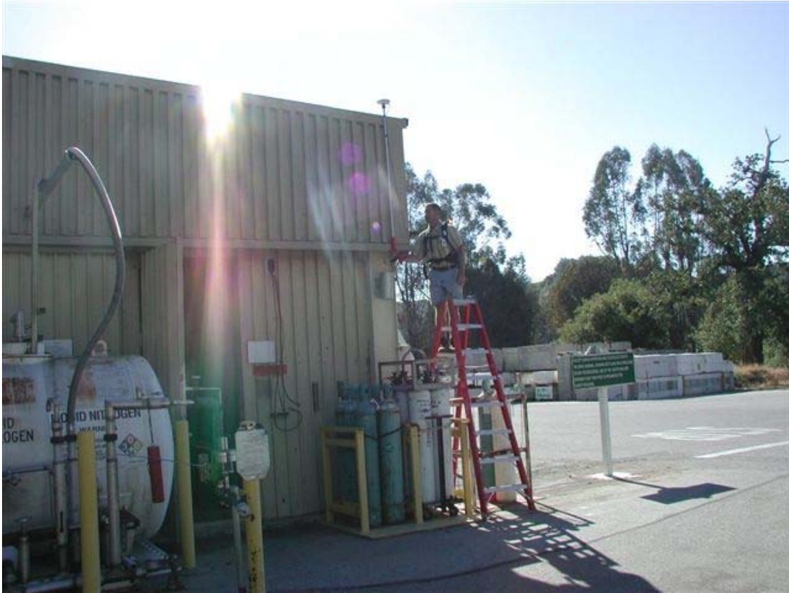
Figure 3: GPS measurement of Gallery west