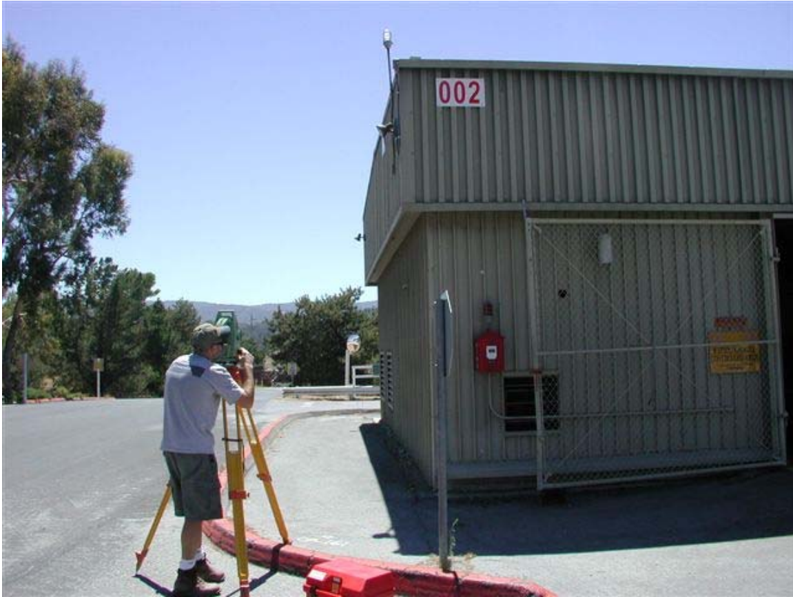
Figure 4: Total station measurement of Gallery east