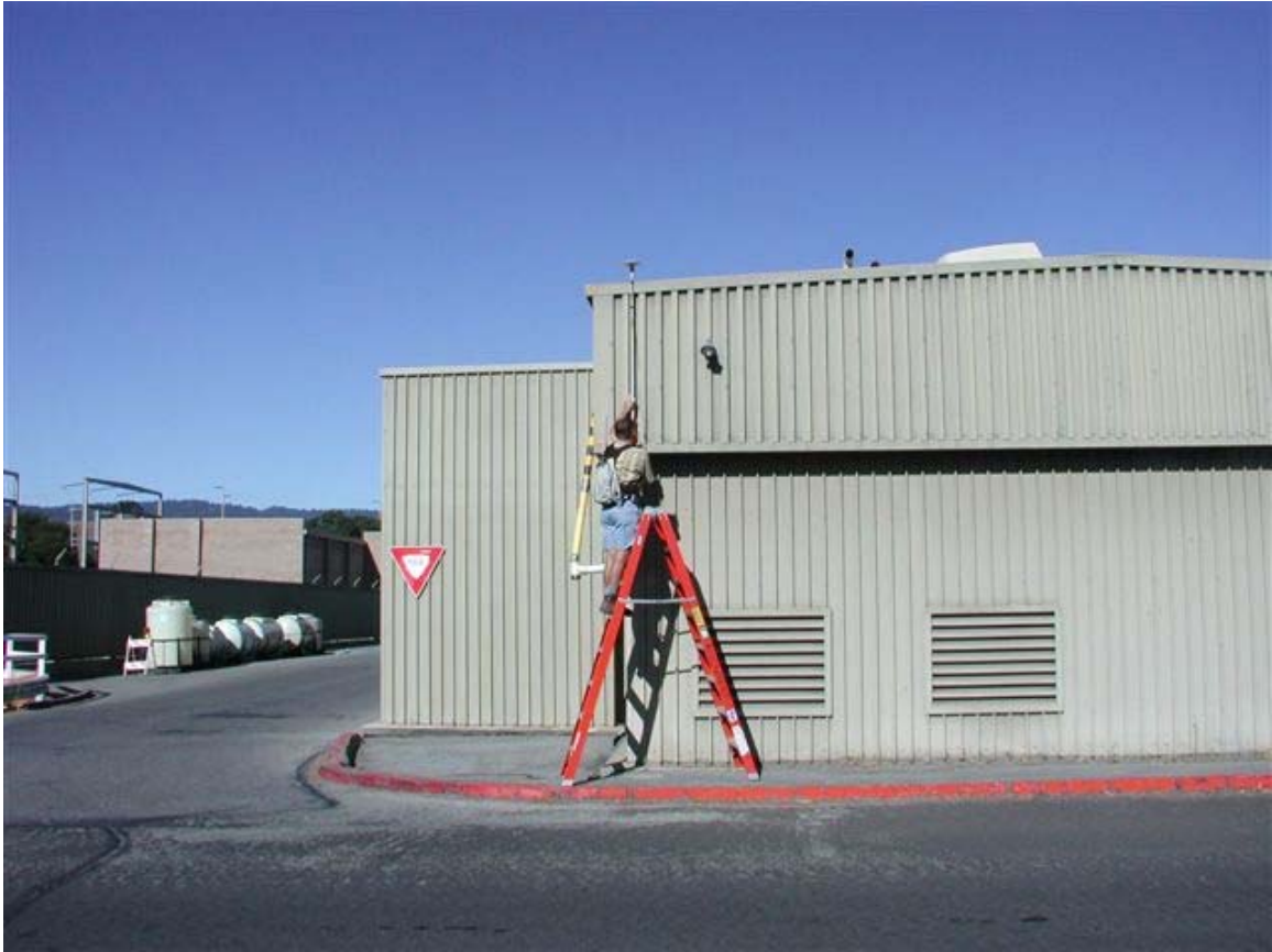
Figure 2: GPS measurement of Gallery east